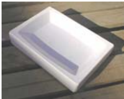
Figure 6: 4936 - RECTANGULAR PRESS