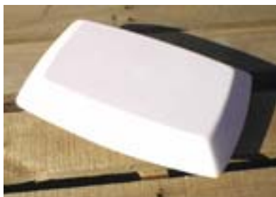
Figure 7: 4937 RECTANGULAR HUMP