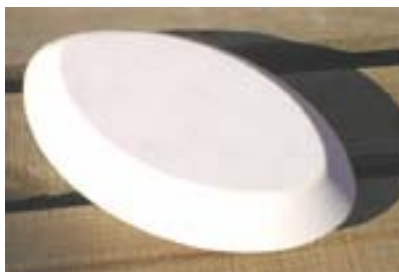
Figure 3: 4933 - OVAL HUMP