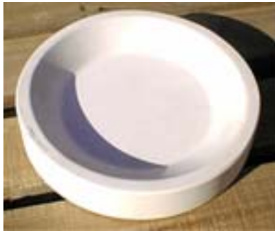
Figure 1: 4930 - CIRCULAR PRESS