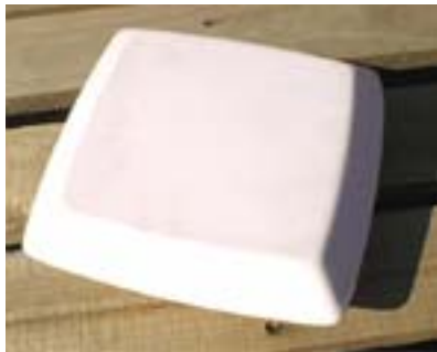
Figure 5: 4935 - SQUARE DISH HUMP