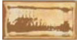
3655 AMBER 5g