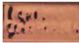
3713 COPPER 5g