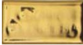
3710 LEMON GOLD 5g