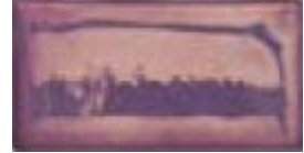
3659 VIOLET 5g