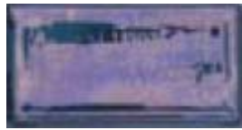
3650 BLUE 5g