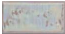
3714 MOTHER OF PEARL (RIS) 5g & 25g

These precious metal and coloured lustres have dissolved metals as their essential component. They are mainly applied by brush on porcelain, glass or ceramic objects and are always applied to already fired and glazed objects. Before firing, the objects must be left to dry for a few hours in a warm, dust free place. Recommended firing temperatures are: Glass: 500°C-600°C, (Cone 022-021) Ceramics: 690°C-700°C, (Cone 018) Porcelain: 750°C-815°C, (Cone 017-015)