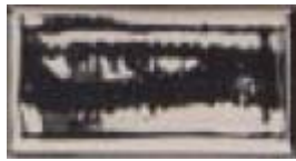
3712 PLATINUM 5g