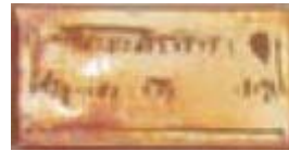
3658 ORANGE 5g