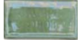
3654 GREEN 5g