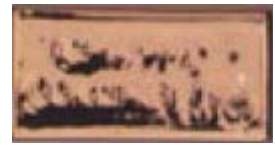
3715 BRONZE 5g