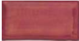
3651 RED 5g