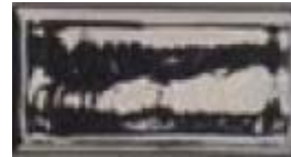
3652 BLACK 5g