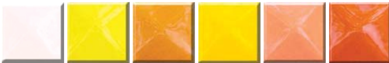
UG001 WHITE 60ml • 500ml

Introducing the new Chrysanthos Underglaze Brush-on Colours. A range of intermixable brush-on colours that can be used up to 1300°C (cone 10)