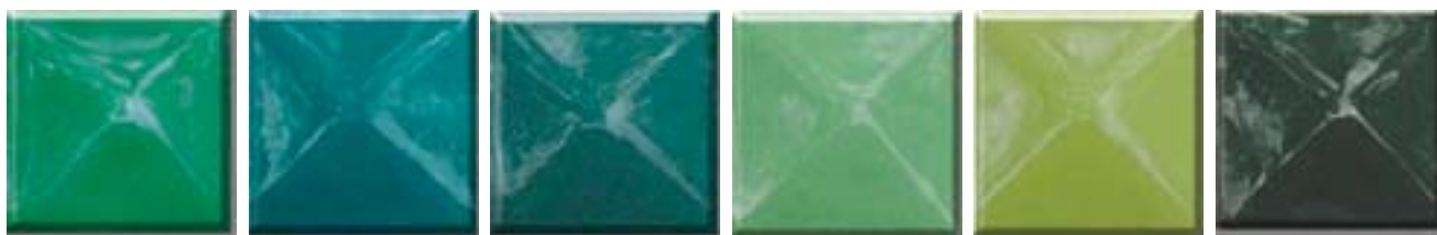
UG101 JASPER 60ml • 500ml