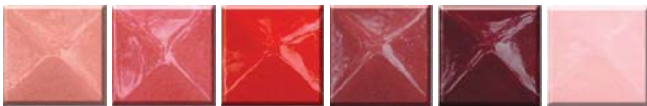
UG061 CORAL PINK 60ml • 500ml