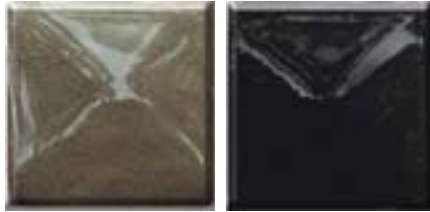
UG209 ANTIQUÉ BROWN 60ml • 500ml